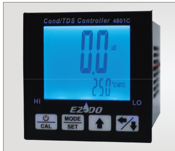
4801C Conductivity/TDS Controller