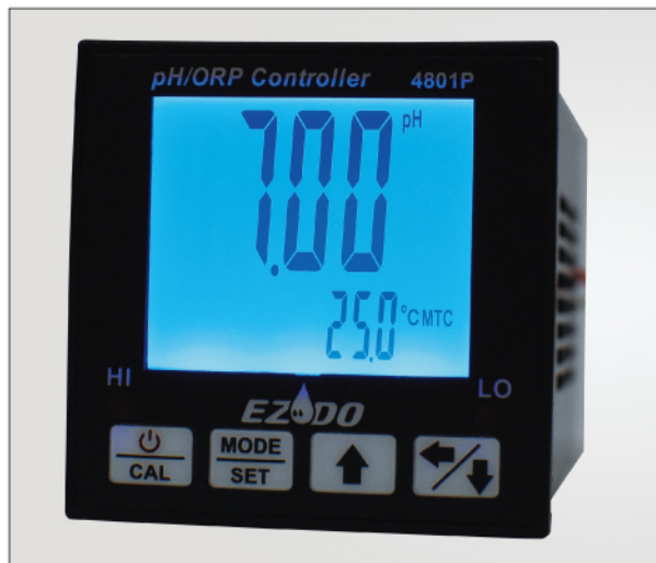
4801P pH/ORP Controller